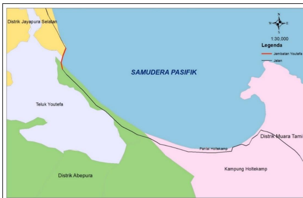
Figure 1. Map of Research Location

This research was conducted for 6 months, from March to August 2020. The research location is Holtekamp Beach (Figure 1), because this location is an area directly affected by the construction of the Youtefa Bridge.