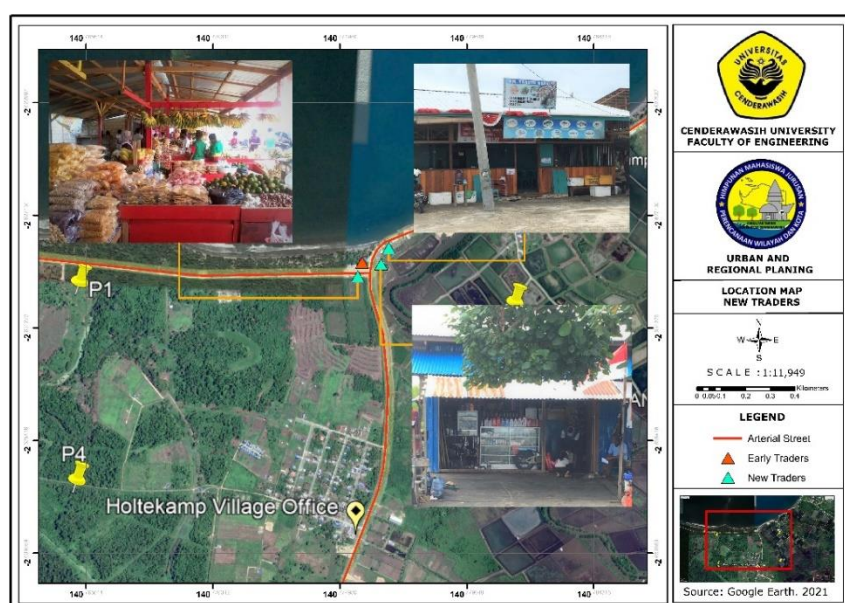
Figure 6. Map of the Distribution of New Business Locations on Holtekamp Beach

According to Table 2, known that economic activity on Holtekamp Beach has increased significantly. This is marked by an increase in the number of business actors and types of businesses in Holtekamp Beach. Before the Youtefa Bridge existed, there was only one permanent business actor on Holtekamp Beach. After the Youtefa Bridge was established, business actors increased significantly to 90 businesses. This is due to the increasing number of people visiting Holtekamp Beach or just crossing the area. This situation provides an opportunity for the community to open a business in this location. The Regional Government also provides a special place (Figure 6) so that business actors and consumers can feel comfortable when conducting buying and selling transactions.