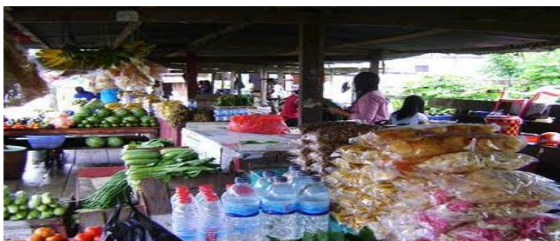
Figure 8. The Commodities for Sale in Stands

As an agricultural area, Muara Tami District has several agricultural commodities. The leading commodities in the agricultural sector in Muara Tami District are corn and sweet potatoes (Anzis, 2019). Corn is a local commodity that almost all traders sell. The corn sold is in the form of freshly cooked boiled corn. In addition, there are snacks and fruit. These items can be souvenirs for visitors. Prices offered tend to be cheaper when compared to urban areas.