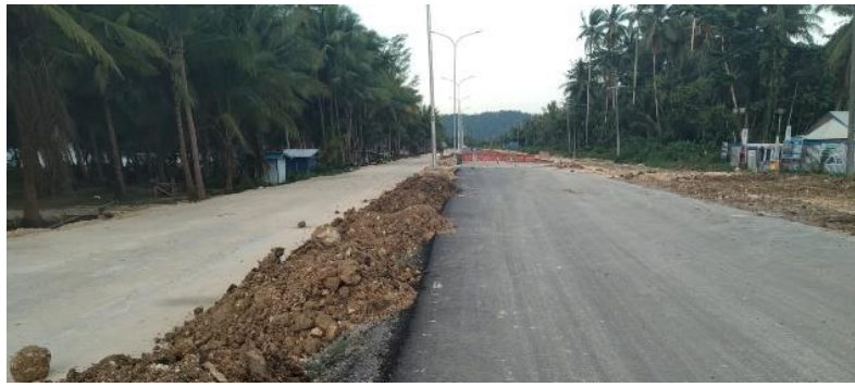
Figure 4. The Condition of Holtekamp Beach When Youtefa Bridge was in Under Construction

The economic activities that existed on Holtekamp Beach before the Youtefa Bridge was completed were only carried out by traveling traders from Koya. The types of merchandise are only snacks for visitors. There are no kiosks or food stalls on Holtekamp Beach yet. Based on data from BPS (2019), there are 17 kiosk units and 2 workshop units in Holtekamp Village, but the location is not on Holtekamp Beach. Meanwhile, there are no food stalls at all in Holtekamp Village.