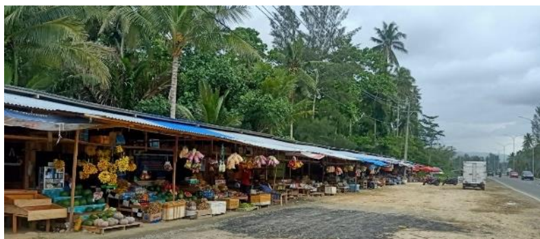
Figure 7. The Location of Integrated Stands on Holtekamp Beach

There is 80 active stand on Holtekamp Beach (Figure 7). The local government provides a special location for these business actors to sell their products. Products sold include agricultural products, snacks, and drinks. But the traders are required to pay rent to the beach manager for IDR 500,000 per month.