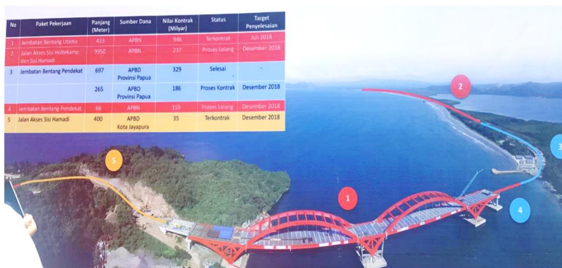
Figure 3. Youtefa Bridge Job Description

Transportation is one of the public facilities that must be fulfilled by the Government. Transportation services are the transfer of goods or people from one place to another so that benefits are obtained, from the economic, social, political, and security aspects (Sadyohutomo, 2009). So, to solve the problem of networking, Papua Government tries to build inter-regional connectivity. One of the inter-regional connectivity development programs in Jayapura City is the construction of the Holtekamp Bridge, which is currently known as the Youtefa Bridge. Youtefa Bridge is a bridge built over Youtefa Bay that connects Hamadi Village and Muara Tami District. The length of this bridge is 732 meters with a width of 21 meters. The construction of the Youtefa Bridge collaborates between the Central Government, the Government of Papua Province, and the Government of Jayapura City (Figure 3).